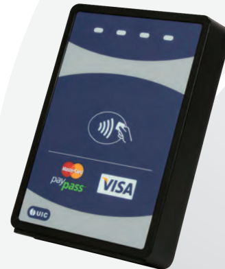
Optional contactless card reader standalone mode is available

UIC is known in the industry for reliable and dependable products. By offering high value in an advanced contactless reader at a reasonable price, contactless transactions are an affordable option to existing retail and financial systems.